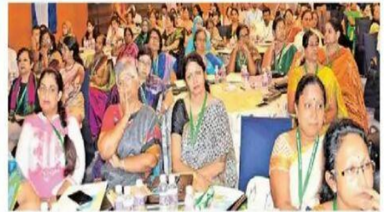
హాజరైన విద్యాసంస్థల ప్రతినిధులు, తదితరులు

ర్తనను ఉపాధ్యాయులు గమనిస్తుండాలని సూచించారు. విద్యార్థుల ప్రవర్తన మారుతున్న తీరును గమనిస్తే అతని సమస్యను గుర్తించడం పెద్ద కష్టం కాబోదన్నారు. విద్యా సంస్థలను, విద్యార్థులను అప్రతిష్టపాలు చేయడం తన ఉద్దేశం కాదని, అయితే ప్రాథమిక స్థాయిలోనే మాదక ద్రవ్యాల మహమ్మారిని నిర్మూలించాల్సిన బాధ్యత విద్యా సంస్థలపై ఉందన్నారు. ఈ వ్యవస్థలో ఇప్పటివరకు 12 కేసులు నమోదు చేశామని, 22 మందిని అదుపులోకి తీసుకున్నామని చెప్పారు. మాదక