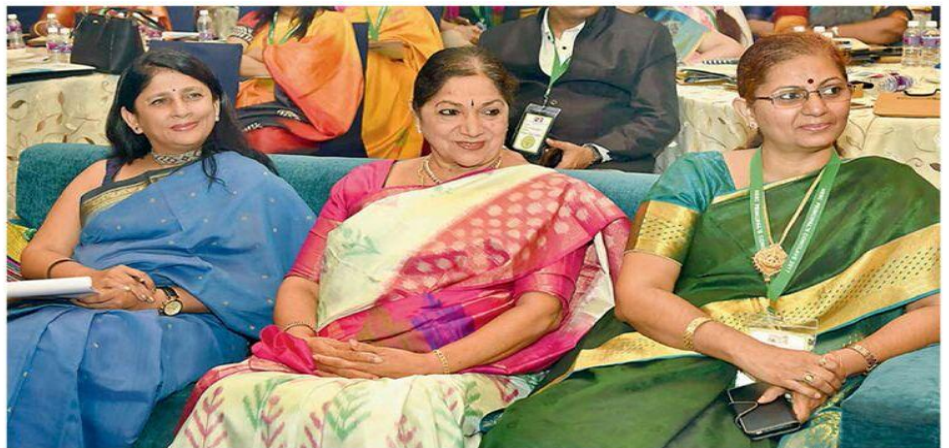
Principals of many city schools were present at the meet